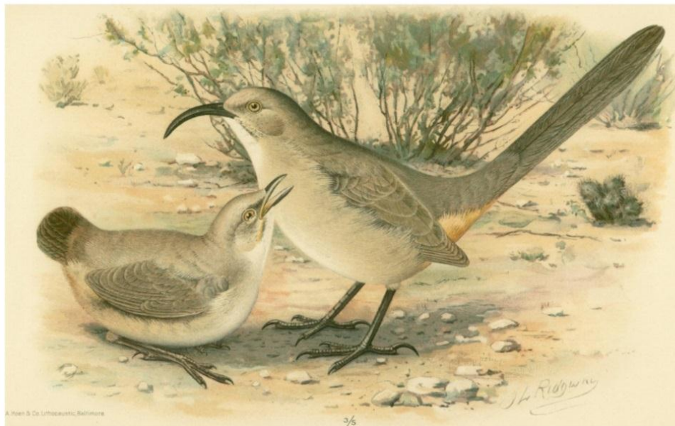
LECONTE'S THRASHER (HARPORHYNCHUS LECONTEI)